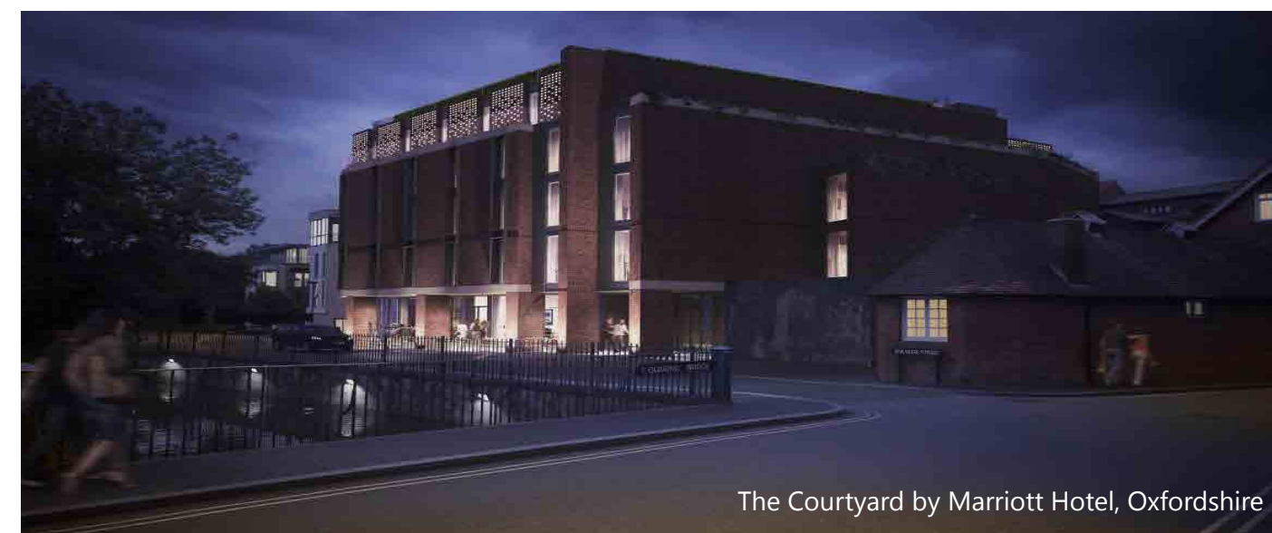
The Courtyard by Marriott Hotel, Oxfordshire