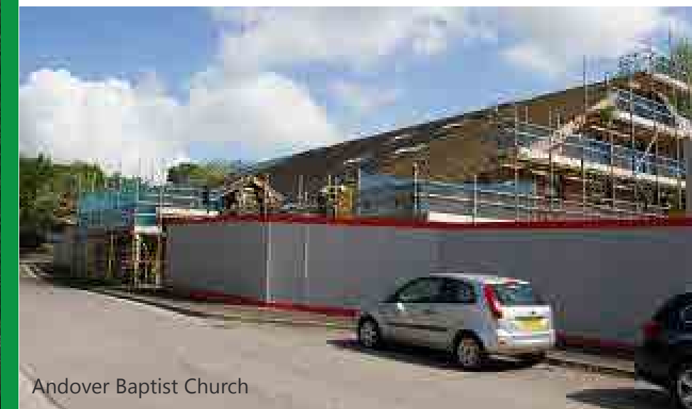
Andover Baptist Church