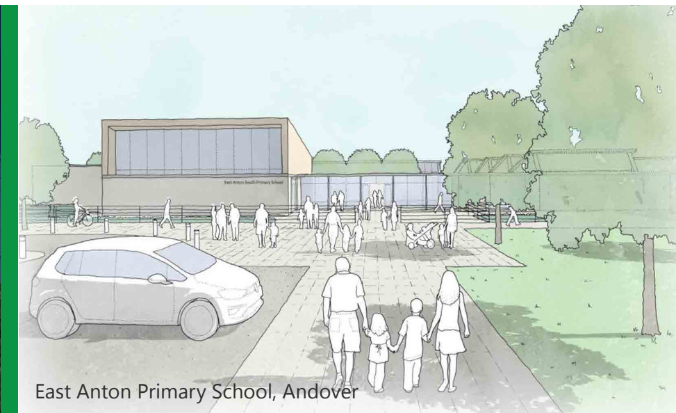
East Anton Primary School, Andover