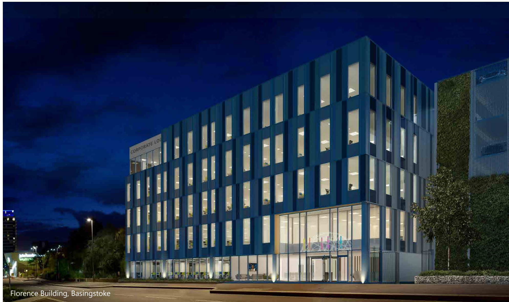
Florence Building, Basingstoke