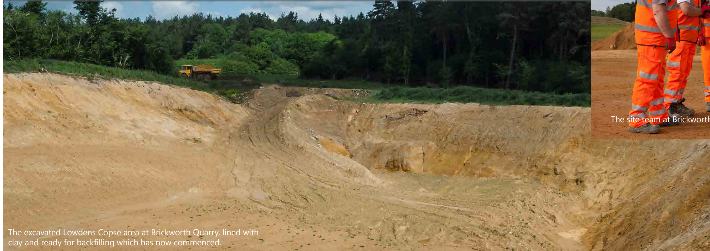
The excavated Lowdens Copse area at Brickworth Quarry, lined with clay and ready for backfilling which has now commenced.

Wiltshire County Council granted planning permission to extend Brickworth Quarry in April, securing the future of this site for the next nine years.